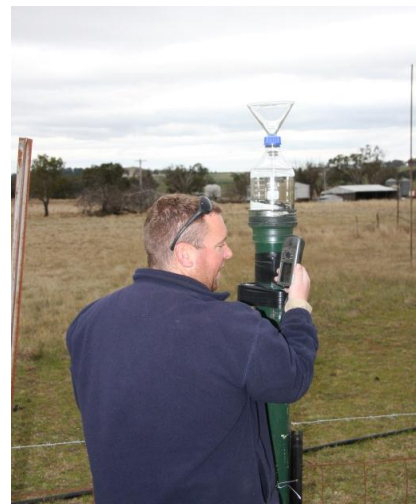
Installing a dust gauge and radiation monitors

As advised in public presentations, the DZP ore deposit contains low levels of the radioactive metals uranium and thorium. A survey for a baseline radioactivity summary has recently commenced. The purpose of this survey is to develop some data around current radioactivity levels at the DZP site before mining commences, and to compare these figures to future measurements that will be taken over the life of the project. Radioactivity occurs naturally in soil, air and water, and so we're expecting to find evidence of some NORM (Naturally Occurring Radioactive Material) radioactivity around the site; this will be carefully monitored over the coming years to ensure that the health and wellbeing of both of our workforce, the local population and the surrounding environment is maintained.