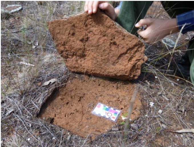
Pink-tailed Worm-lizard habitat