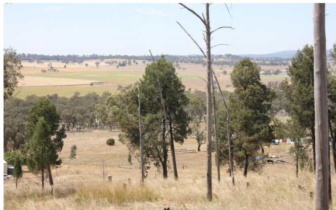
View southeast from above the Obley Road towards proposed DZP

A visual impact assessment measures the level at which the mine site changes the appearance of the landscape in which it exists. It will form an important part of the overall Environmental Impact Assessment. Alkane staff have been visiting the farms near the DZP site and taking photographs of their existing views in preparation for the development of a 3D model of the DZP, which will give Dubbo locals a clear idea of what they can expect to see once the site is completely developed.