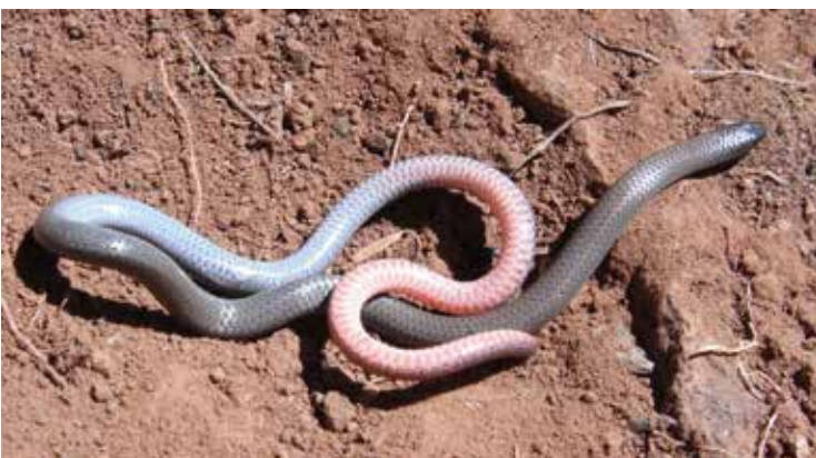
Alkane won the 'Environment Excellence' category for Pink-tailed Worm-Lizard conservation efforts