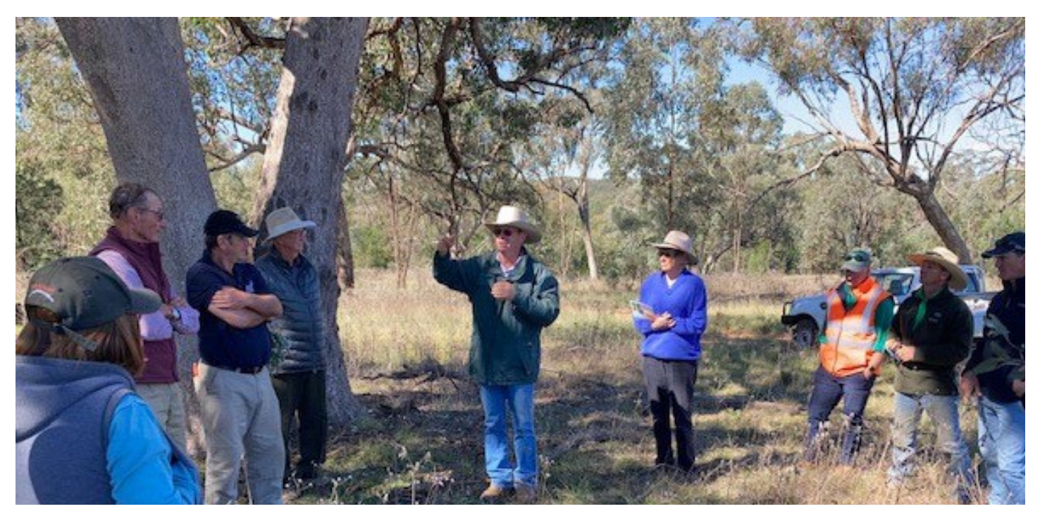
Participants at the Grey Box Grassy Woodlands on Farms workshop