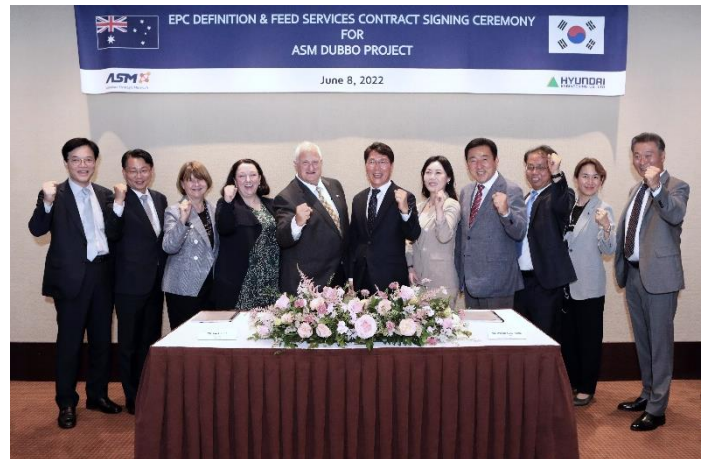
Signing ceremony for EPCD conditional contract, Seoul, Korea

HEC will produce an open book cost estimate for the execution phase of the Dubbo Project on completion of the EPCD work. This will form the basis of an EPC offer from HEC to deliver the Dubbo Project.