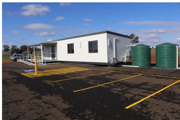
Above and below: ASM's newly constructed Dubbo Project site office

With our Occupation Certificate received, we can officially move in and start making ourselves at home.