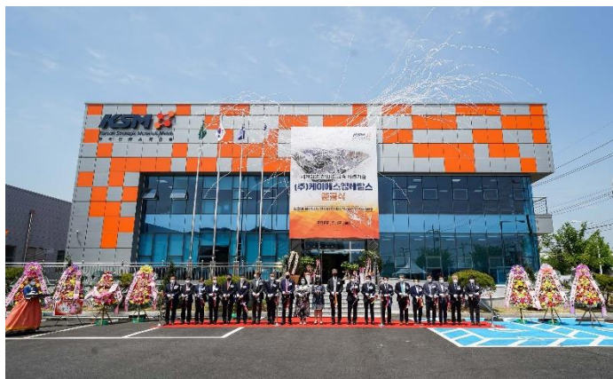
Opening of ASM's Korean Metals Plant, Ochang, Korea

On Thursday 12th May we officially opened our first high purity critical metals plant in Ochang, South Korea.