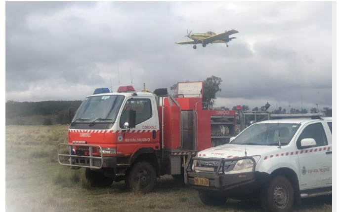
ASM's farm hosted an RFS aerial fire response training day