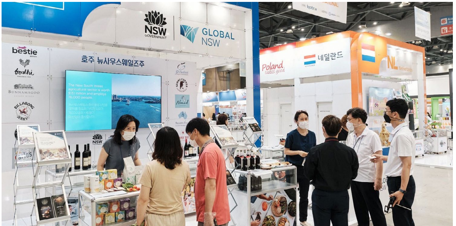
Native Secrets' products, some distilled from TPC's White Cypress Pine trees, on show in Seoul.