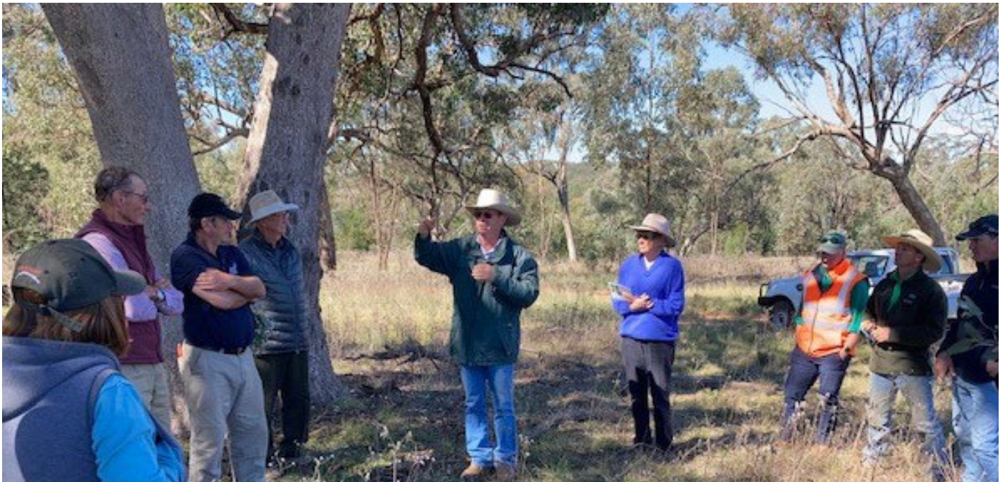
Participants at the Grey Box Grassy Woodlands on Farms workshop