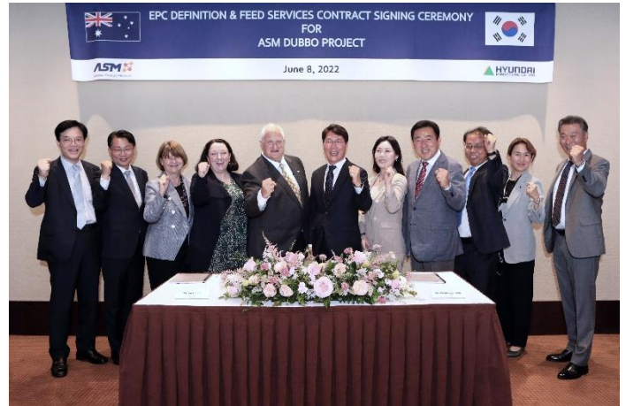
Signing ceremony for EPCD conditional contract, Seoul, Korea

HEC will produce an open book cost estimate for the execution phase of the Dubbo Project on completion of the EPCD work. This will form the basis of an EPC offer from HEC to deliver the Dubbo Project.