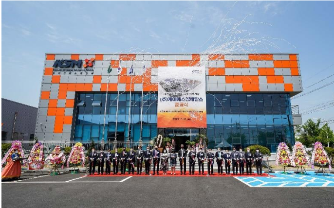
Opening of ASM's Korean Metals Plant, Ochang, Korea

On Thursday 12th May we officially opened our first high purity critical metals plant in Ochang, South Korea.