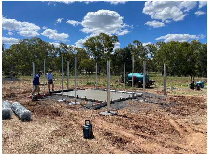
Laying the slab for the monitoring station at Wychitella.

Initially, the monitoring station will collect weather and air quality data. At a later date, noise and gas monitoring equipment will also be installed.